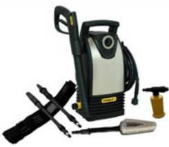
Electric Pressure Washer